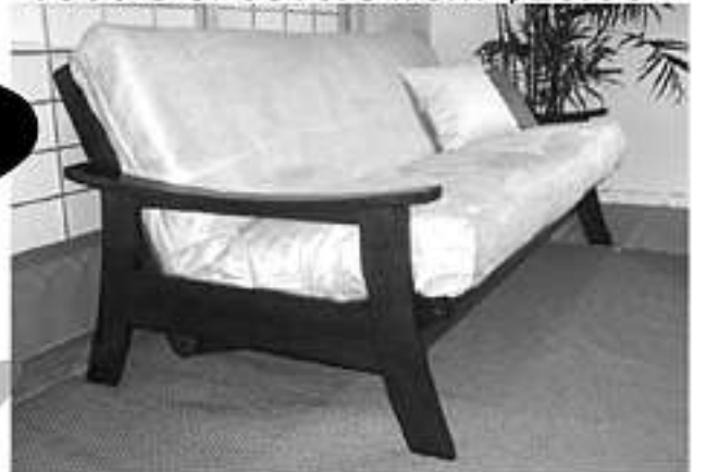
delicious dark cherry asia-design hardwood frame reg $299

12 types of mattresses from $69.95 50 styles of frames from $69.95 1000's of covers from $29.95