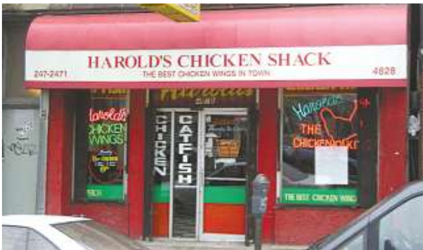
Storefront of Harold's No. 4